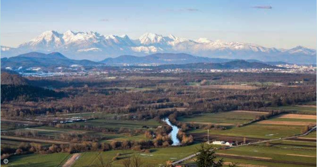
Marshland park south of Ljubljana.