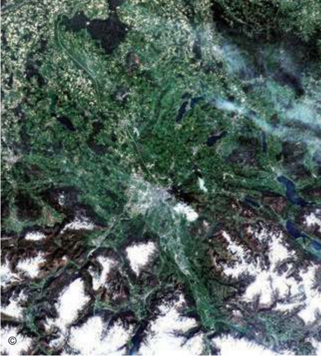
Aerial view of Salzburg 1:500,000