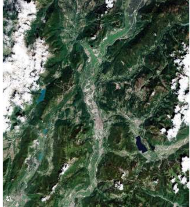
Aerial view of Trento 1:500,000

The city region of Salzburg is located in the northern part of the Austrian federal state of Salzburg and to a minor extent in the southwestern part of Upper Austria, at the border to Bavaria, Germany. It consists of a core zone (11 municipalities) and an outer zone (35 municipalities) where 110.731 inhabitants live. At the transition of the northern Alpine foothills and the western part of the northern „Limestone Alps“ it lies in the “Salzburg Basin” and partly in the Salzach valley. The capital city of Salzburg is situated by the river Salzach and its 156.100 citizens live on an area of 65.7 km 2 . However, the population of the city area is increasing, especially in peri-urban areas, which leads e.g. to urban sprawl, increase of traffic, housing shortage, a lack of building land and last but not least environmental issues.