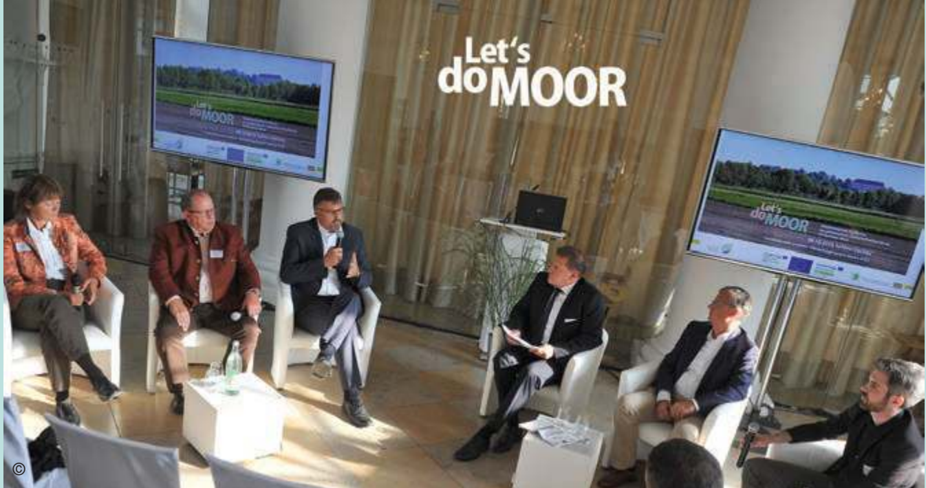
© Landscape conference with politicians near Munich.