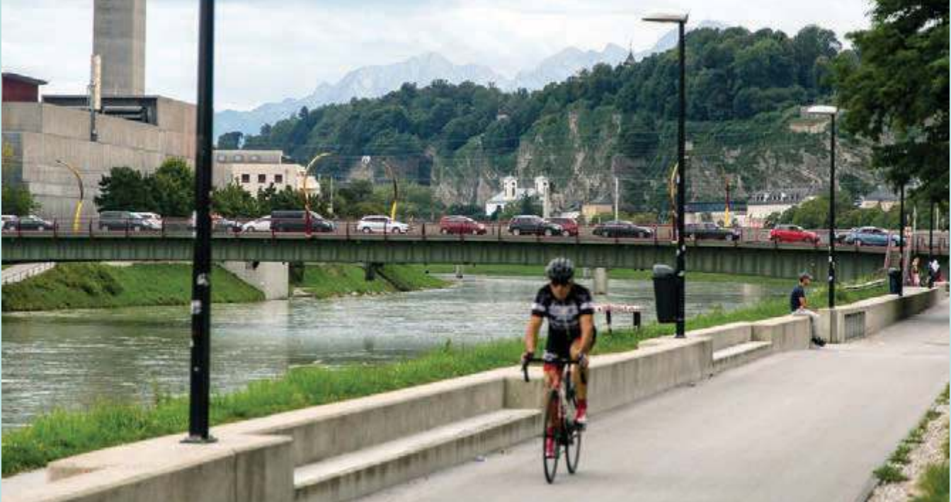
Multifunctional GI near Salzburg.

and provide test beds for the approach. Cautious steps at the start included many individual talks, thus gaining acceptance and exceeding initial expectations. Workshops involved more experts and stakeholders. The steering group includes the Regional Association Salzburg City and the Surrounding Municipalities, the City of Salzburg, the Federal State of Salzburg, and the District Authority of Salzburg with SIR leading the Eco-pool activities. Actions to consolidate the Eco-pool are included in follow-up projects, legal adjustments and nesting the concept in the new development plan of the Federal State of Salzburg. As the project aims to network and influence mind-sets in favour of cooperation, a gradual process is required. Where interests collide, conflicts need to be defused. For a more participatory approach including the broader public, additional resources are necessary.