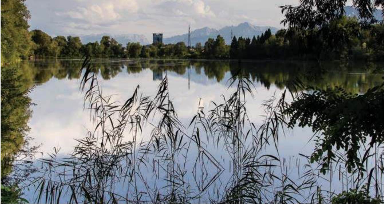
Salzachsee close to Salzburg.

in the future. In the long term we will develop a strategic landscape plan that steers green infrastructure and prevents ad-hoc compensation measures. Local action plans will support implementation of the first compensation measures.