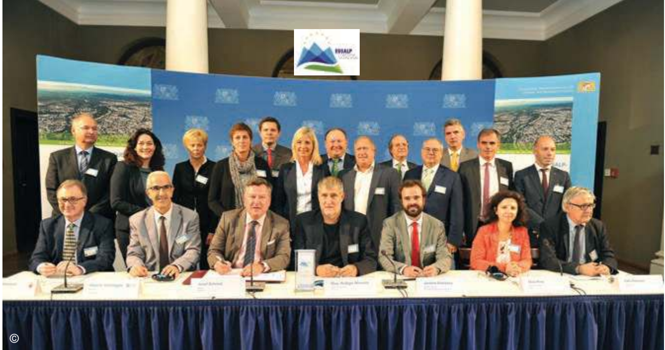
© Political representatives of cities and metropolitan regions and national/regional (EUSALP) ministers

governance. The strategy is an integrated framework endorsed by the European Council addressing common challenges faced by the Alpine core and its surrounding areas. EUSALP provides an opportunity to improve cross-border cooperation, identifying common goals and implementing them more effectively together. EUSALP action group 7 focuses on developing ecological connectivity to enhance ecosystem service provision across the entire Alpine region. At a joint conference, as we launched our Network, the EUSALP environmental ministers approved the political declaration “Alpine Green Infrastructure – Joining forces for nature, people and the economy”. We, the City Network members, welcome the initiative of AG 7 for