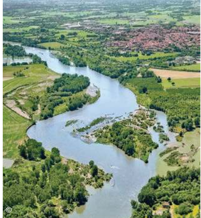
Aerial view of Stura di Lanzo river.

We conducted an analysis to identify the most important factors of vulnerability and resilience for the area of Corona Verde. To do this, we divided the area into landscape-environmental units (LEU). Through the application of spatial indicators, we were able to identify the characteristic factors for landscapes of Corona Verde and the LEUs.