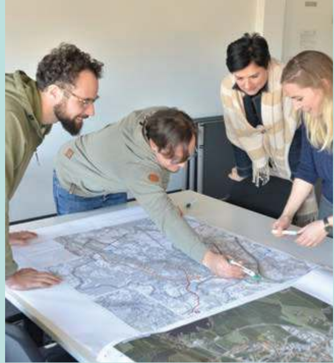
Working group in Salzburg.

Two main stakeholder groups were involved in the “Ecopool Salzburg” project: governmental and non-governmental stakeholders. The first and core group are governmental stakeholders, namely the administrative level of the City of Salzburg, the Regional Association of Salzburg City and its surrounding communities, and the regional government of Land Salzburg, with the departments of nature conservation, spatial planning, agriculture, etc.. They were chosen because they are decision makers, key stakeholders and/or own planning sovereignty. We involved them through individual talks, discussions as well as several meetings and workshops. We aimed to design the cooperation process based on equal communication on a level playing field. The cautious start with