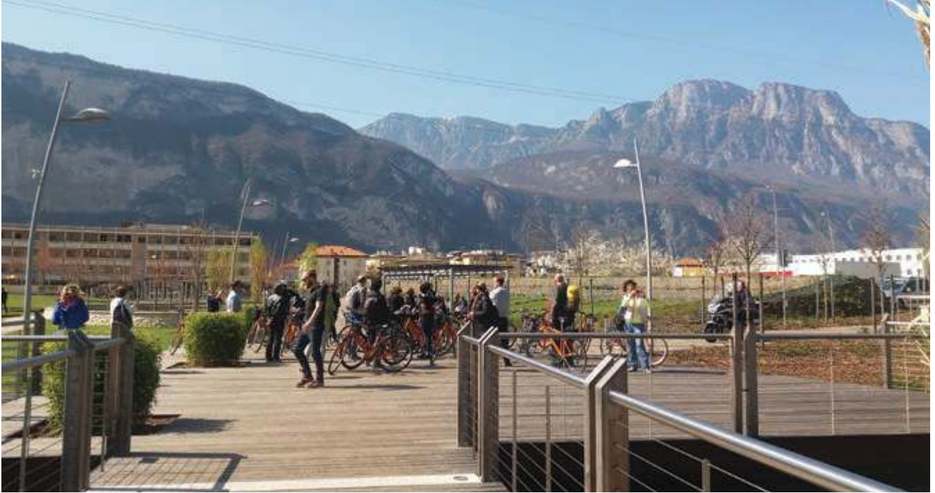
Bike trip by the LOS_DAMA! group in Trento 2017.

Following the data mapping process, we worked with primary school children to create a “discovery game” around ecological features of peri-urban parks. This will be used for further educational activities. We also created a guide to public parks and gardens based on pathways from the city to the mountains for citizens and tourists.