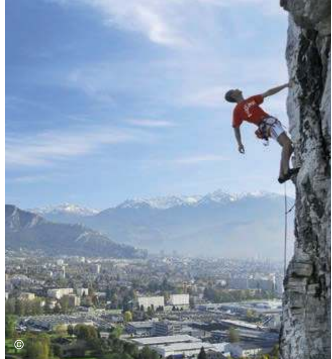
Climber with Grenoble in the background.

Even if some of these landscapes still seem rural in nature, they are part of the metropolitan area and their inhabitants live an urban way of life. The exhibition will show how these areas evolved and will show a vision of the future in 20-30 years' time. The exhibition, planned for November 2019, will illustrate this with six different use cases.