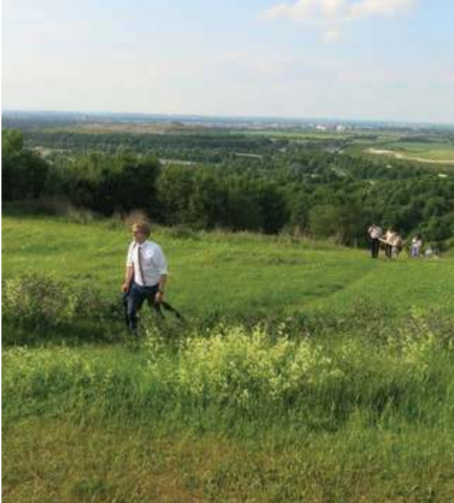
Local mayor and project partners visiting the north of Munich.

Different land uses such as gravel mining, military use, and sheep pasturing have led to wide heathland areas, little forest patches and lakes that provide a unique landscape next to the big city. In 2007, the Heathland Association released a non-binding intercommunal masterplan - the "Landscape Strategy Munich North". It aims at balancing landscape preservation, nature conservation, cultural heritage and recreation. Our pilot activity seeks to "activate" the propositions of this plan through better readability. Digital media and innovative forms of visualisation will support decision makers and inform citizens. Additionally, the Heathland Association has relaunched its website and we helped the municipalities to emphasise landscape more strongly on their website. The association will build on the renewed awareness and the improved "vision" of the plan to enhance intermunicipal green infrastructure.