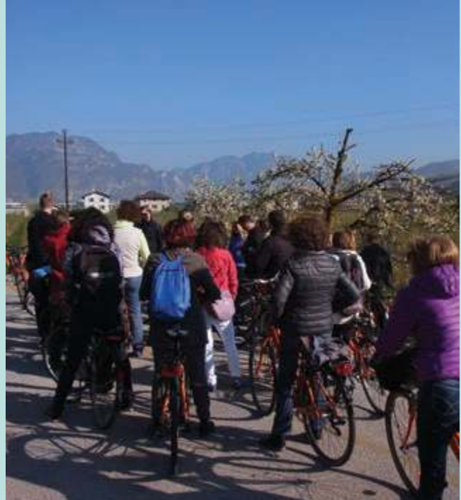
Bike trip in Trento.

The neighbourhood councils and schools were one of the most important stakeholders of the pilot project in Trento. They are fundamental to 'translating' the key messages of “LOS_DAMA!” on the ground and into a more operational level. The local participatory implementation projects were also experiments for learning lessons for upscaling measures to other neighbourhoods and impulses for long-term strategic planning. With regard to the neighbourhood councils, the most challenging issue was to relate their involvement to long-term strategic projects as these projects do not have an immediate and specific impact on their own territory. To tackle this challenge we tried to break down our activities to the local level to show the added benefits for the neighbourhood. We discussed our intermediate results frequently with the neighbourhood councils to get as much feedback as possible during the process and thus create commitment and a common mind-set. The pilot project with its steps towards a comprehensible strategic plan illustrates a new and more transparent process of planning with stakeholder involvement for the future. In the future, collaboration between departments in the administrative bodies should be further strengthened. In addition, more attention should be paid to the social aspects of planning, which implies collaboration also with the social departments in order to work together on required improvements.