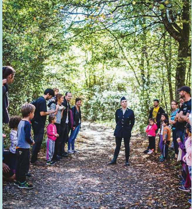
Treasure hunt in Grenoble.

With our third pilot activity, Munich and the northern heathland association are focussing on better visualisation and a stronger digital presence of landscapes. At the core, we have a long existing, yet non-binding landscape plan that will be transformed with a new and modern design. While we hope to activate implementation for enhancing green infrastructure, this new and attractive presentation will also reach out to the public. We gave a makeover not only to the umbrella website of the association, but also to individual members' websites. During this process, we found that landscape issues have often been missing on municipal websites. Hopefully, the new “picture” of Munich’s peri-urban landscapes will paint a thousand words about their importance for our well-being and reconnect the responsible municipalities.