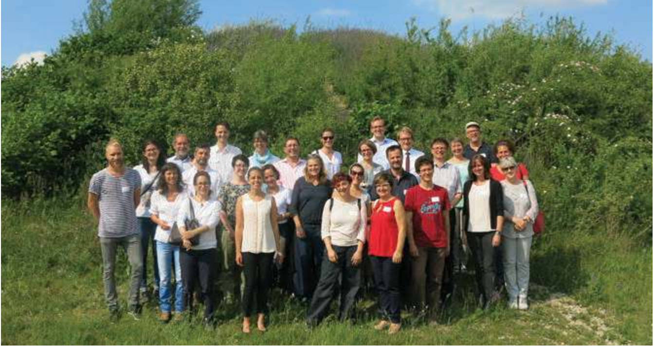
LOS_DAMA! partners and observers in Munich 2017.