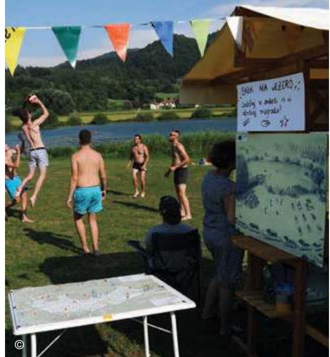
Lake Podpeč south of Ljubljana.