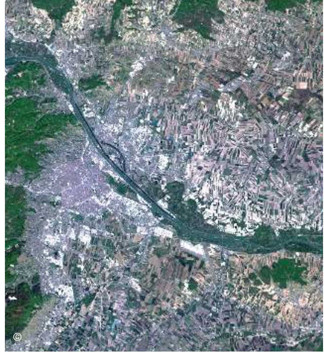
Aerial view of Vienna 1:500,000

The landscapes within these areas are rather “ordinary”, mainly composed of agricultural lands in the valleys and forests and meadows in the foothills. Despite recent efforts to control growth, the peri-urban landscapes remain under strong pressure of urban expansion. The GAM pilot finds new ways to better respect the peri-urban landscape in order to preserve and extract value from it.