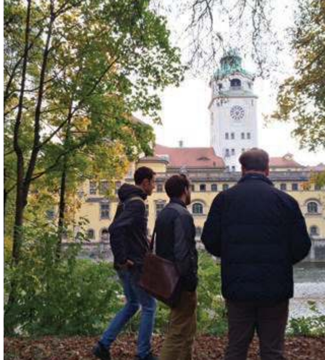
Officers from the City of Trento visiting the City of Munich

This variety of scales and levels helped LOS_DAMA! to build a comprehensive set of recommendations and tools to enhance peri-urban green infrastructure. Now, they are ready to be applied for cities and regions facing similar issues. A network of experts from the partnership and other interested colleagues will continue to promote insights and results. In applying and continuing our work, we will further raise awareness and develop and enhance knowledge and implementation. To offer access for all interested parties we have set up groups on landscape and open space development in city regions on different social media platforms, which are open to new members.