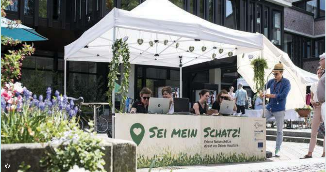
Information stand at a local market south of Munich.

to avoid these shortcomings. It will mount an exhibition showing how the functions of six areas have evolved and what they could be in 20 to 30 years' time: