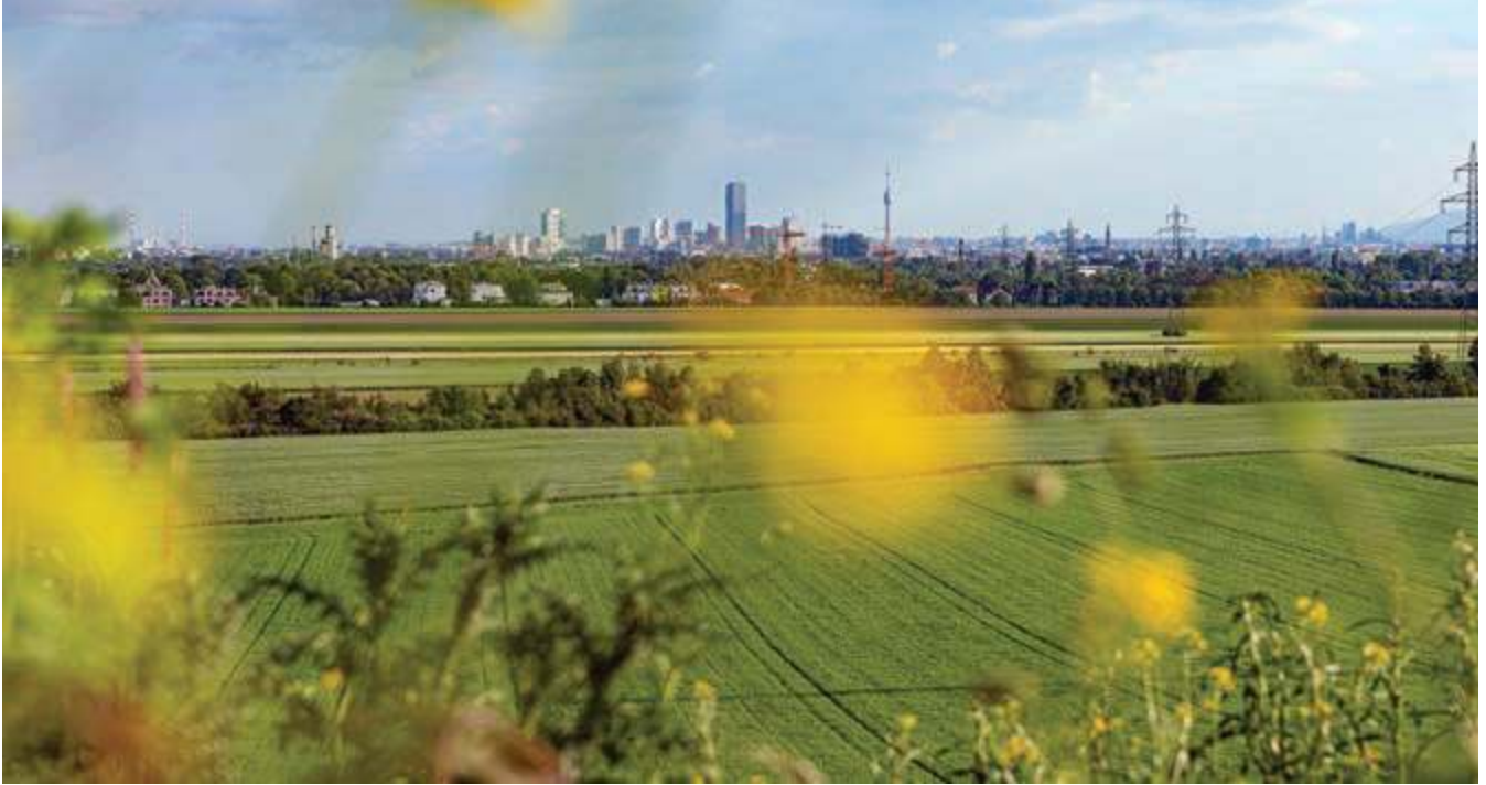
View of the city of Vienna from DreiAnger regional park

various name proposals both online and via voting card. This is how the “DreiAnger Regional Park” got its name. It refers to the traditional shape of municipalities in the area – the green hearts – the Anger – of Stammersdorf, Gerasdorf and Süßenbrunn.