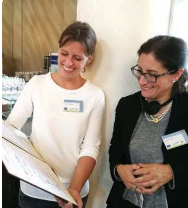
Signed Memorandum of Understanding.

We strive for cooperation of local authorities in metropolitan areas to enhance urban, peri-urban and rural open spaces. Working together with interest groups, stakeholders and the broader community is a core feature of our activities. Our goal is to identify areas and existing infrastructures suitable for continuing development into green infrastructure. We will further develop tools and approaches