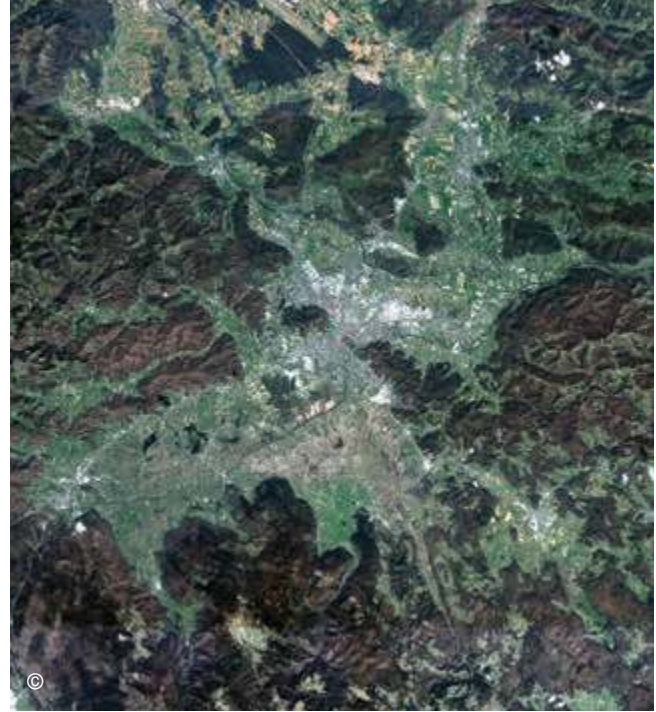
Aerial view of Ljubljana 1:500,000

The centre of the Piedmont Region is the city of Turin with about 890,000 inhabitants. The metropolitan area is home to over 1.8 million people in about 90 municipalities. Turin is situated 20 km east of the Alps. The river Po crosses the city and is supplied by smaller rivers like Dora Riparia and Stura di Lanzo that cross the city region. As the metropolitan area is growing, the Piedmont Region has developed the strategic project Corona Verde, aimed at green infrastructure (GI): a system of open spaces is to be implemented to improve biodiversity and other ecological, economic, social and cultural functions. Corona Verde builds relationships within the city and between the city and the surrounding area. It serves as testbed for a new management system for Green Infrastructure.