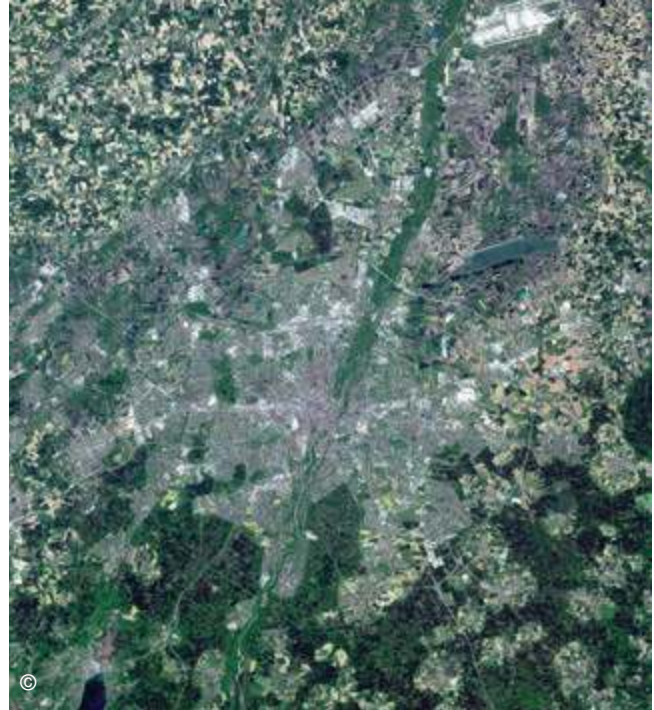
Aerial view of Munich 1:500,000

While the landscapes, populations and planning systems differ in each of the metropolitan regions, they face common challenges regarding peri-urban landscapes: high land-use pressure and multiple, often conflicting uses of landscapes on the urban fringe. Enhancing peri-urban landscapes despite those challenges is the common aim of LOS_DAMA!. These ordinary landscapes provide a large variety of functions such as water retention, food supply and biodiversity and contribute to the improvement of human well-being in metropolitan regions. We have been learning from each other how to enhance peri-urban landscapes and we can offer experiences to many other cities and metropolitan areas of the Alpine region.