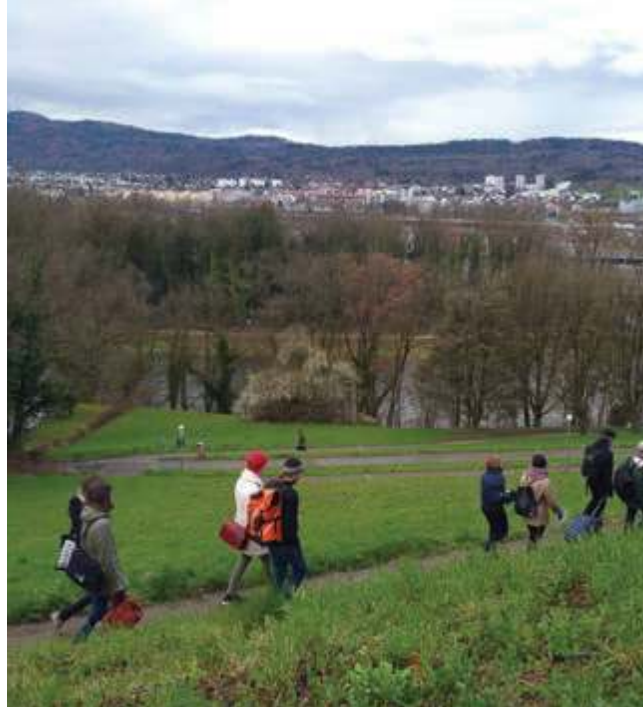
LOS_DAMA! project partners visiting the City of Zurich.