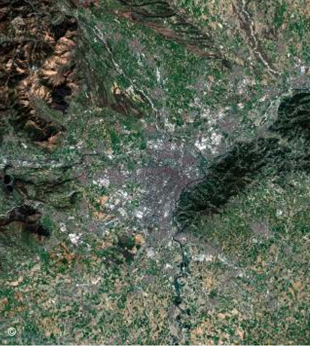
Aerial view of Piedmont 1:500,000