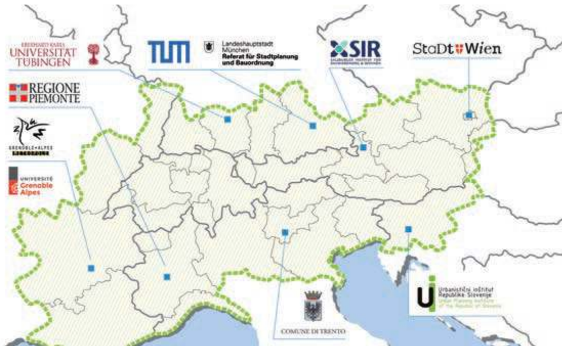
LOS_DAMA! project partners located in the Alpine Space.

closely cooperated with EUSALP Action Group 7, which aims at developing ecological connectivity across the whole EUSALP territory.