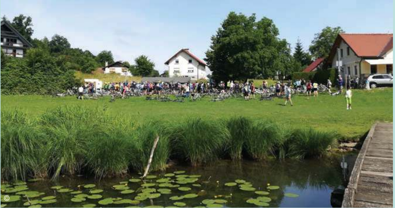
Recreation area south of Ljubljana.

a scavenger hunt to create more tolerance for different demands, functions and uses within the park. Games, riddles and costumed actors addressed different points of view. The personal and lively presentation of demands created insights and empathy for other uses among participants. More than 1,500 citizens, mostly families, enjoyed the entertaining game while learning more about the park and its multifunctional uses. In order to reach practitioners and decision-makers, we launched four masterclasses on different topics. The aim of the masterclasses was to discuss how to strengthen ecological stakes. As the participants were practitioners and decision-makers from different sectors, improving multifunctionality of uses was a key topic. We learned that addressing multifunctionality by using concrete real-world examples greatly helped a great deal in creating a common understanding and reducing implementation difficulties.