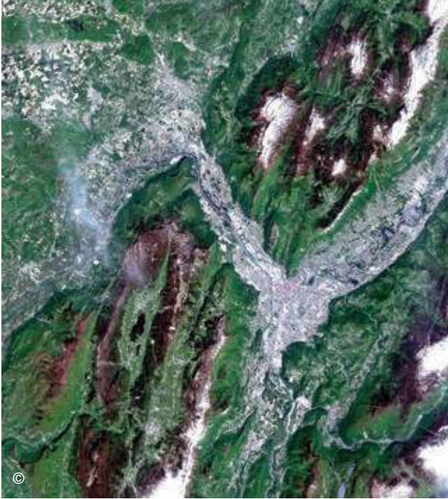
Aerial view of Grenoble 1:500,000