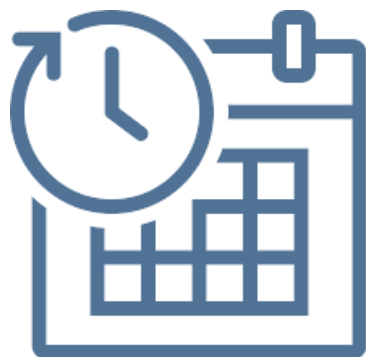
Duration (max. till 30/06/2022)