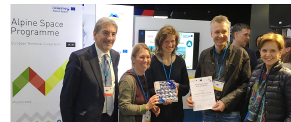
GaYA project partners receive the video competition award